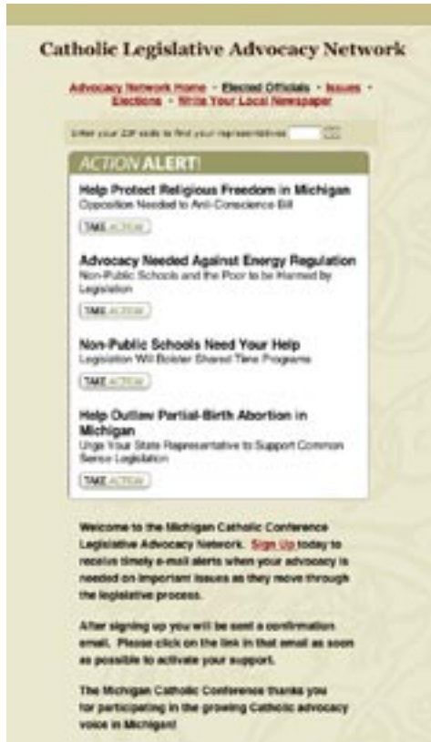
The Catholic Legislative Advocacy Network

Conference does not share subscriber information with any other individuals, groups or organizations.